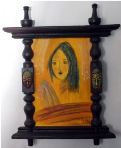
Joy of being a woman