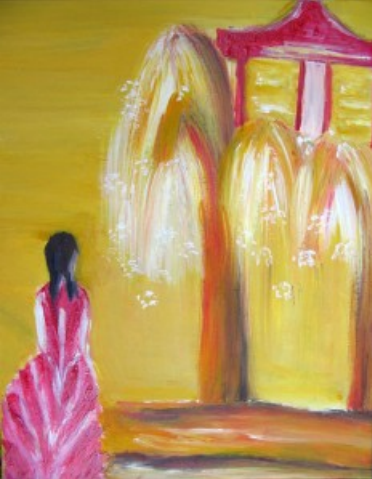
Memories from back home in the form of a painting