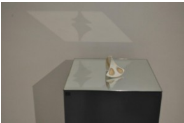
The Tetrarch, a chief attraction of the artwalk

Initially, she started working with two dimensional wall flaring figures and due to her fascination with varied forms of life and nature, these figures were brought out in various forms like seeds and discs. The basic nature, shapes and colors of these seemed to evoke something in her which then evolved into her various latter sculptures. Later on, she started exploring with basic forms of 3D figures like square, sphere, cubes and pyramids, of 2 to 15 inches in size. Fifty of these figures were displayed in an exhibition once.