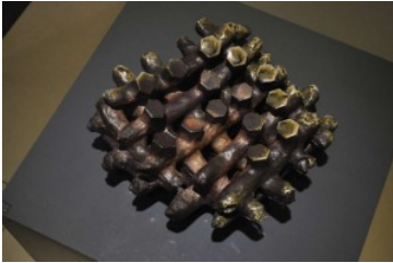
Various hexagonal shapes displayed at Tasmai Art Gallery

Initially, she started working with two dimensional wall flaring figures and due to her fascination with varied forms of life and nature, these figures were brought out in various forms like seeds and discs. The basic nature, shapes and colors of these seemed to evoke something in her which then evolved into her various latter sculptures. Later on, she started exploring with basic forms of 3D figures like square, sphere, cubes and pyramids, of 2 to 15 inches in size. Fifty of these figures were displayed in an exhibition once.