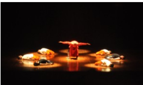
Interpreting Tagore: Walking Tall