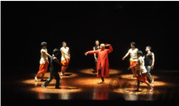
Interpreting Tagore: Walking Tall