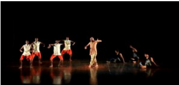
Interpreting Tagore: Walking Tall